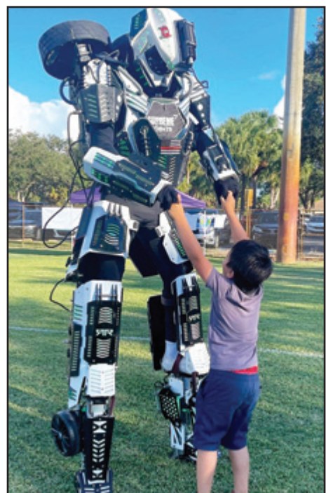
Children interact with a giant Transformer from Supreme Robots