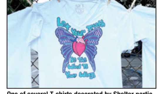
One of several T-shirts decorated by Shelter participants as part of the Clothesline Project on display at the Peace Fair