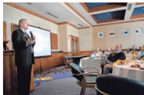
Sheriff Kevin Rambosk talks about how law enforcement responds to slavery and trafficking.

The average stay at the shelter is six to eight weeks, but Oberhaus said for victims of domestic abuse it is more like six to eight months for trafficking victims who have been rescued. To help address the growing need, especially in eastern Collier, the shelter has launched a capital campaign to build a 20,000-