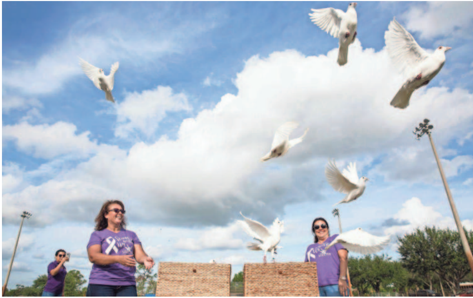
Doves were released at the Peace Fair in Immokalee on Monday. The event, which was hosted by the Shelter for Abused Women and Children, offered food, music and games for families while also raising awareness about domestic violence.