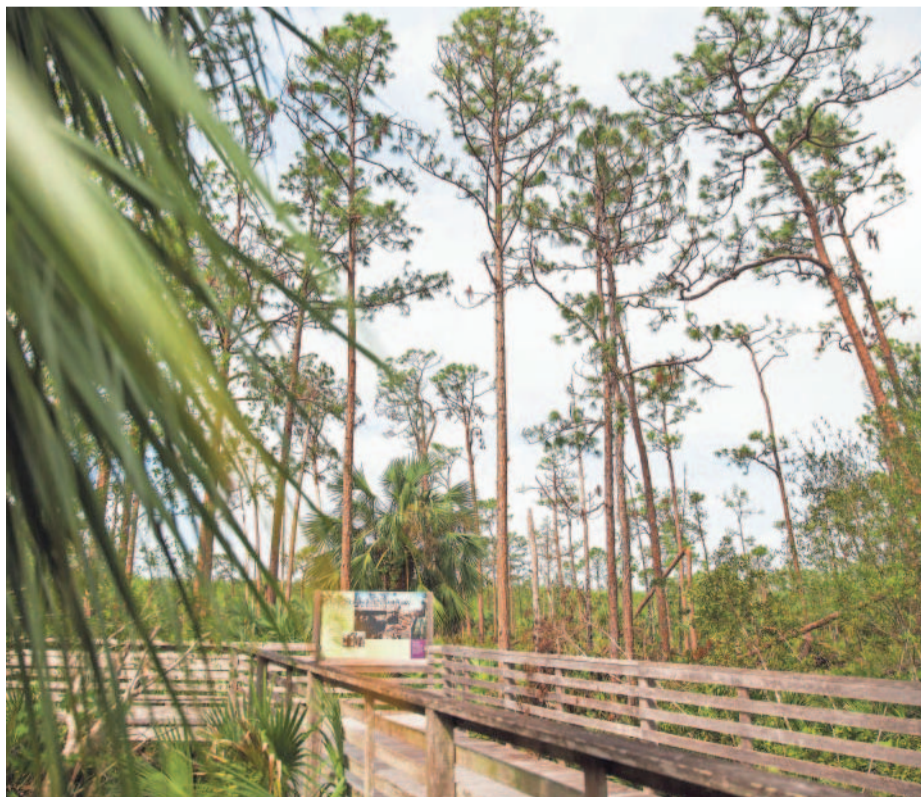
Gov. Rick Scott went to the Audubon Corkscrew Swamp Sanctuary east of Bonita Springs on Monday to announce his budget recommendation of a $1.7 billion investment in Florida's environment.