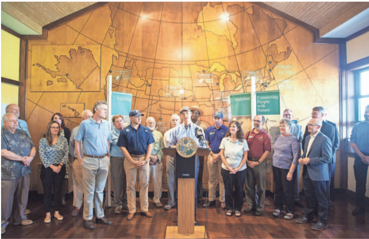
Gov. Rick Scott, at podium: "This funding includes historic investments in our iconic springs, world-renowned Everglades, award-winning state parks and beautiful beaches."