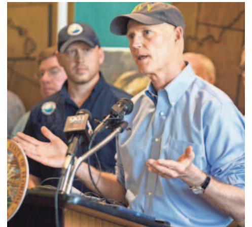
Gov. Rick Scott, at the Corkscrew Swamp Sanctuary east of Bonita Springs on Monday, announces his budget proposals for environmental conservation. More details of Scott's budget are expected in the next few weeks.