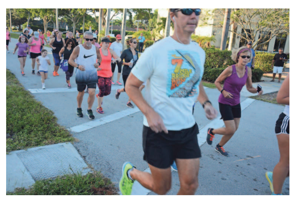
The group heads out from the Shops of Marco.

As the participants headed out, it was possible to see the difference between an