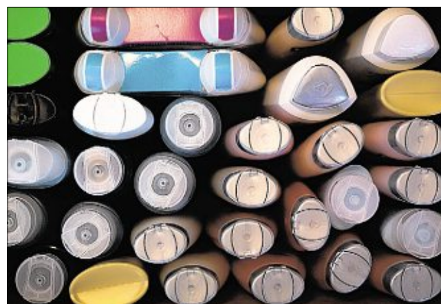
A box of donated bathing supplies awaits delivery to the Shelter for Abused Women and Children.

"I'd like to learn how to do the couponing, too. I just don't think I have