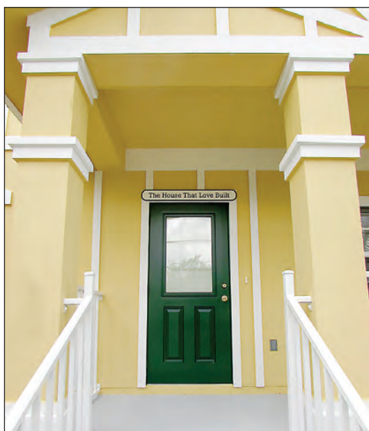
Transitional cottages are sponsored by philanthropic benefactors, who name the cottages. Shown is Cottage Seven: The House that Love Built.