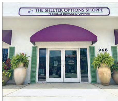
The Shelter Options Shoppe, located at 968 Second Avenue North in Naples, provides funding as well as clothing, furniture and household supplies for shelter participants.

The best defense is a good offense, and The Shelter is currently underway developing The Shelly Stayer Shelter to be built in Immokalee. While there are existing resources in that area, there is no physical shelter to provide emergency relief to victims of domestic violence. It is the generous