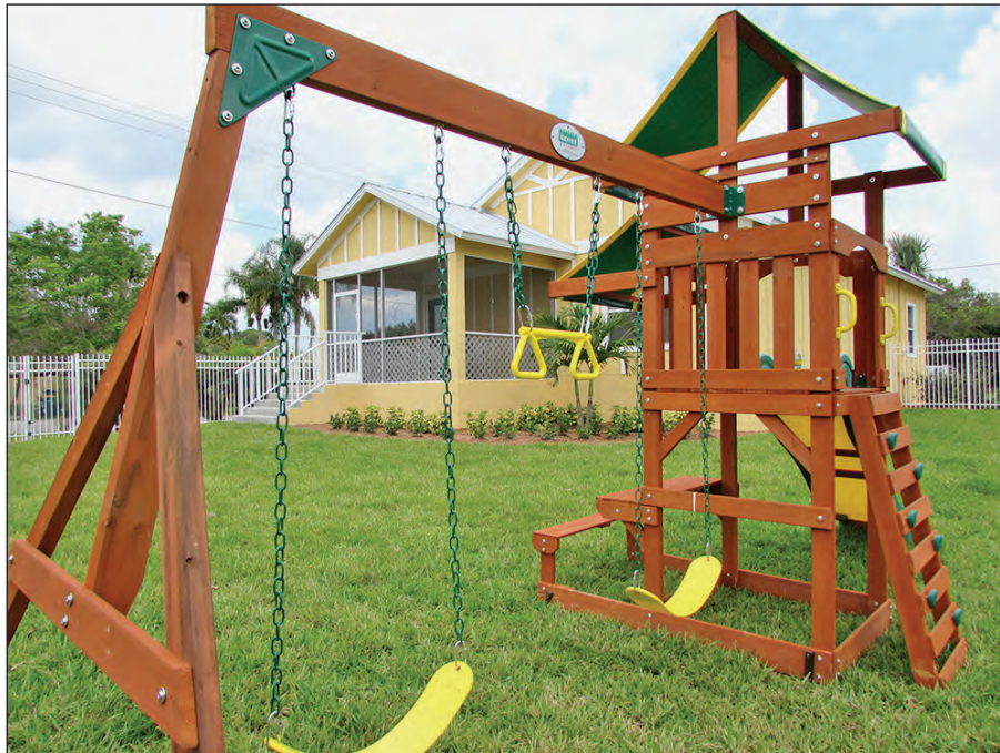
A shared play area located between two of the seven transitional cottages that are available to families leaving emergency shelter.

From left: Kaydee Tuff, Naomi Goren and Jane DeMado sit on the special butterfly seat. The butterfly represents transformation and symbolizes overcoming one's obstacles.